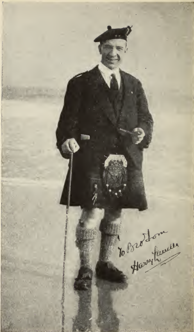
ON THE BEACH AT ATLANTIC CITY